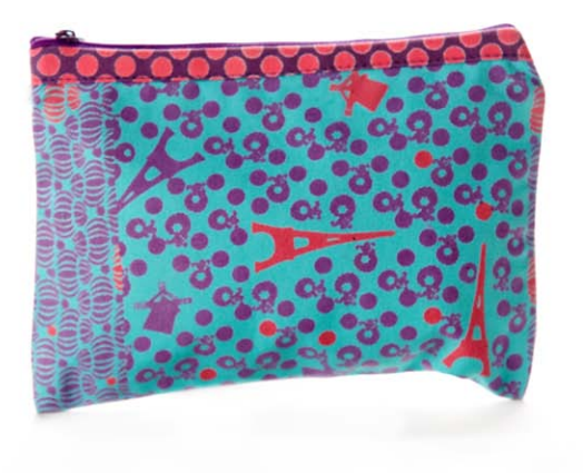
TEAL EIFFEL TOWERS

Zip.Lg.ET 100% Cotton, zips across length of top, fully lined. 8.2" W x 6" H Made in France