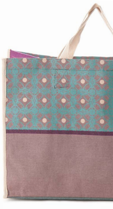
FULL PATTERN, TAUPE