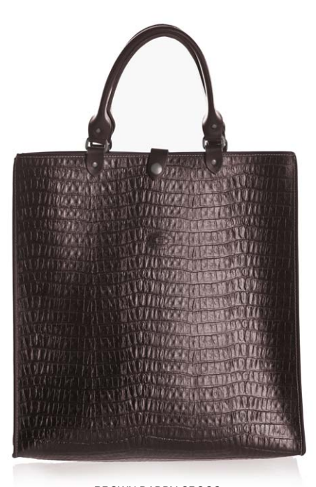
BROWN DADDY CROCO

Hard pressed recycled leather Handle drop 6.25". 11.25" W x 4.5" D x 16.25" H. Made in France