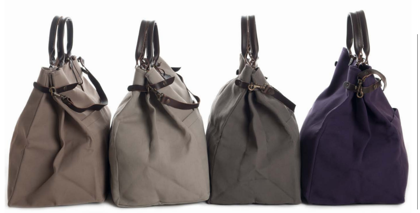
TAUPE GALET/STONE ARDOISE VIOLET