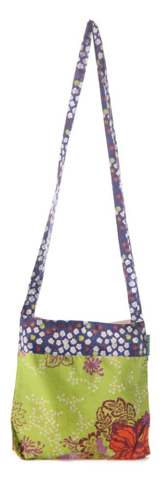
HIBISCUS PRINT IN LIME, WITH DARK BLUE LIBERTY ACCENT