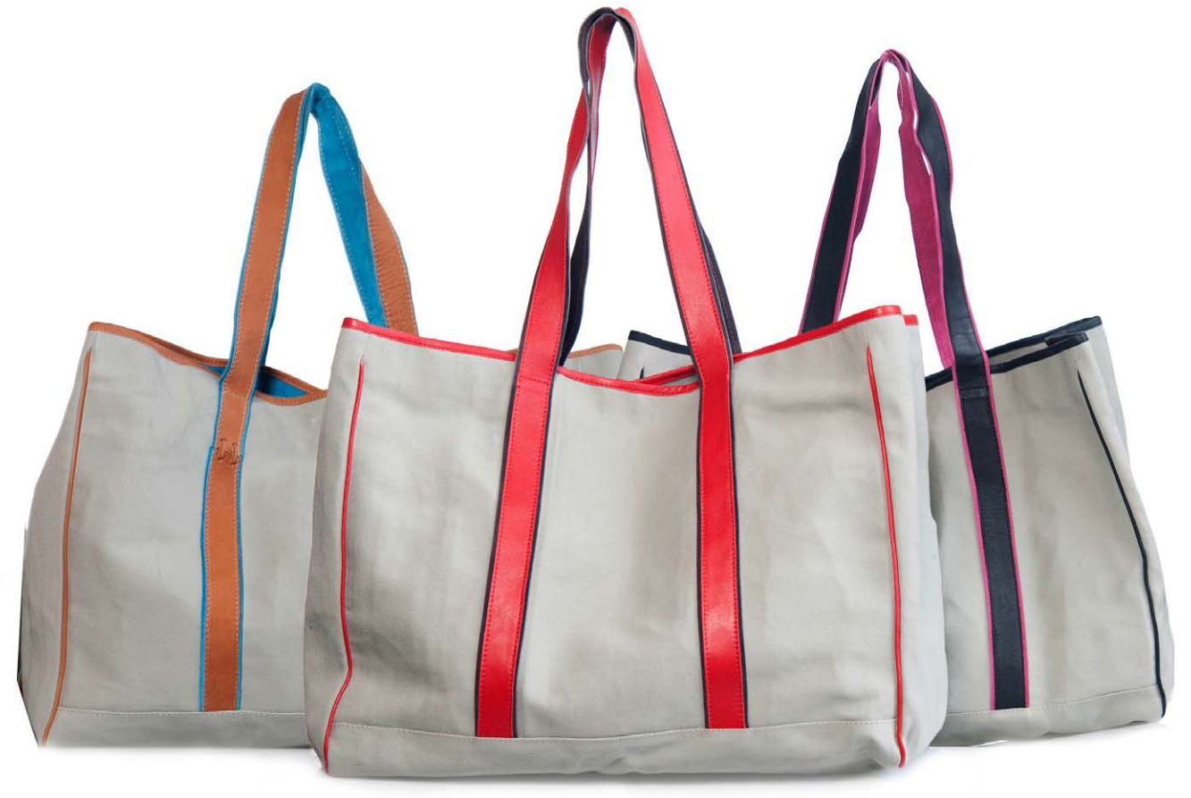
NATURAL LEATHER TRIM, TEAL BLUE SUEDE ACCENT