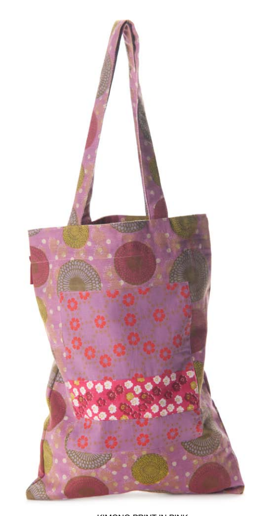
KIMONO PRINT IN PINK