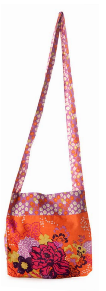
HIBISCUS PRINT IN MANGO, WITH PINK LIBERTY ACCENT