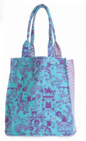
TEAL PARIS PATTERN

100% Cotton. Internal zip pocket. Handle drop 8". 12" W x 5.5" D x 16.5" H. Made in France