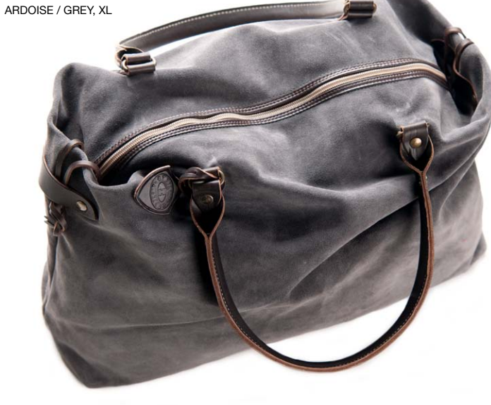
ARDOISE / GREY, XL