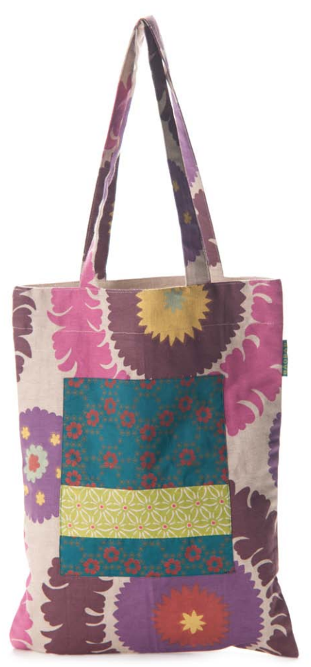
SUZANI PRINT IN PLUM & PINK