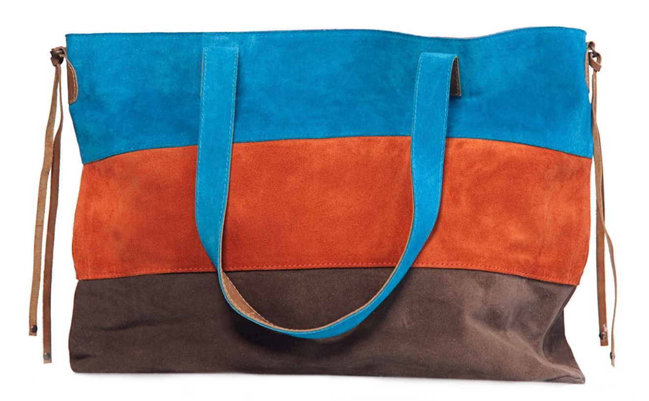
TURQUOISE / ORANGE / TAUPE