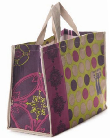
CIRCLES ON LIME